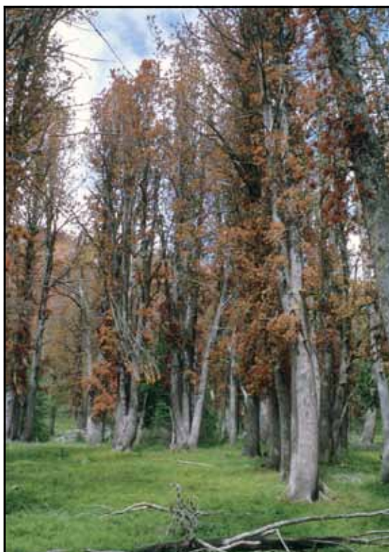
Mountain pine beetle-killed whitebark pine in Yellowstone National Park, 2004.

Mountain pine beetles can reproduce in all species of pine within their range. Outbreaks often develop in dense stands of large-diameter (>8 inches), older (>80 years-old) lodgepole pine and dense stands of mid-sized (8-12 inches diameter) ponderosa pine. When weather is favorable for several consecutive years, severe outbreaks can occur in high-elevation stands of whitebark and limber pine. Widespread outbreaks develop over several years and can result in millions of dead trees. Periodic losses of high-value, mature sugar and western white pine are less widespread, but also serious.