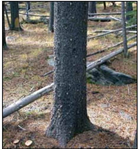
Figure 3: Pitch tubes and boring dust—indicative of a successful mountain pine beetle attack in lodgepole pine.

Needles on successfully infested trees begin changing color several months to a