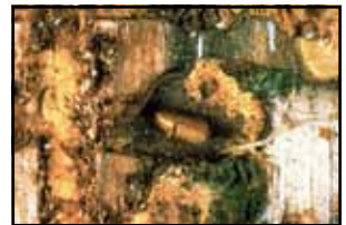
Figure 10. "Callow" or immature adults darken before emerging to complete life cycle.